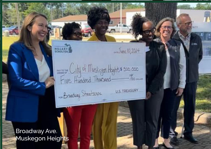
Broadway Ave. Muskegon Heights